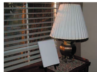
A Blank Canvas - On Bedroom Dresser