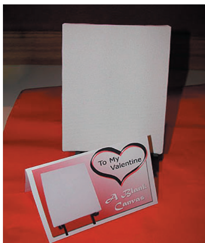
Example Gift - for Valentine's Day

Includes: White Artist's Canvas (5x7 inches, approx.), Table-top Easel, Choice of Personalized Gift Card, and more.